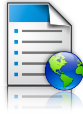
Forms and Favorites

Display Customization: Display a customized, scrolling slideshow on the color touch screen to communicate important messages to users while the printer is in Power Saver mode.