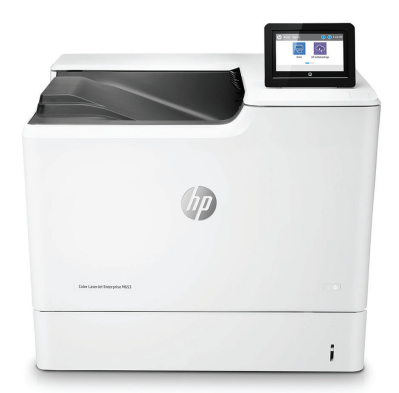
HP Color LaserJet Enterprise

This HP Color LaserJet Printer with JetIntelligence combines exceptional performance and energy efficiency with professional-quality documents right when you need them—all while protecting your network with the industry's deepest security.