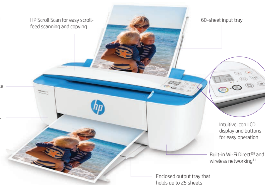
HP Scroll Scan for easy scroll-feed scanning and copying

Don't let its tiny size fool you. The HP DeskJet 3700 series is full of features you need, and the convenience you want.