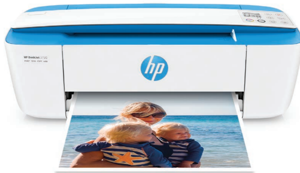
HP DeskJet 3720 All-in-One