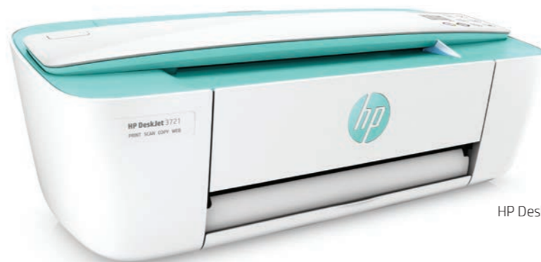
HP DeskJet 3721 All-in-One

Compact for your space and wireless for your life, this all-in-one delivers the printing power, independence you need, and comes in beautiful hues you want. Enjoy printing, scanning, and copying from virtually any mobile device. 1 Designed to fit and look good anywhere, you'll love the world's smallest all-in-one for home. 2