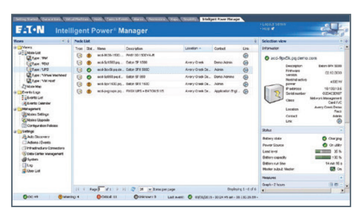
Intelligent Power Manager plugs into VMware's vCenter dashboard.

The 9PX provides line and match EBMs for extended runtime.