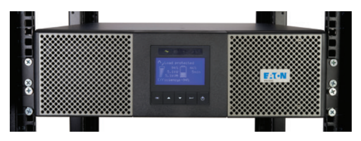
Each 9PX includes a 4-post rail kit.

The 9PX has the versatility to meet the demands of a wide array of IT applications.