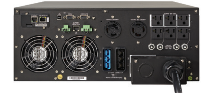
Split-phase models incorporate flexible receptacle configurations that natively offer 120V and 208V. Rear panel of 9PX 6K split-phase shown above.