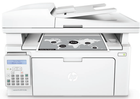
HP LaserJet Pro MFP M130fn

Print professional documents from a range of mobile devices, 1 plus scan, copy, fax, and help save energy with a wireless MFP designed for efficiency.