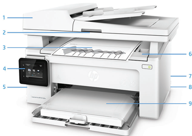
HP LaserJet Pro MFP M130fw