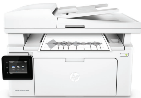
HP LaserJet Pro MFP M130fw