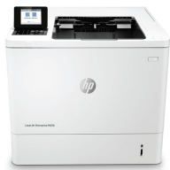
HP LaserJet Enterprise M608n

This HP LaserJet Printer with JetIntelligence combines exceptional performance and energy efficiency with professional-quality documents right when you need them—all while protecting your network from attacks with the industry's deepest security. 1