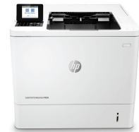
HP LaserJet Enterprise M608dn