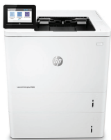
HP LaserJet Enterprise M608x