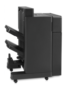
The two-bin, 3,000-sheet booklet maker with 2 or 3 hole punch, one of two optional finishing accessories that can save you time.